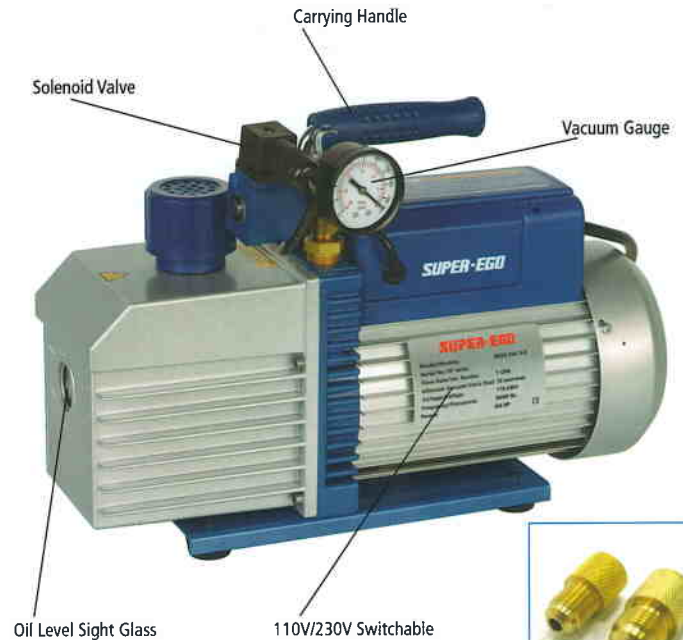
Supplied with 5/16" & 3/8" Adaptors